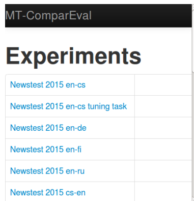
Figure 1. Part of the start-up screen of the evaluation panel with a list available experiments at wmt.ufal.cz.

Once the user selects an experiment, an evaluation table with all relevant tasks (Figure 2) is shown. The table contains (document-level) scores for each task entry calculated by (a selected subset of) the included automated metrics. The panel also includes a graphical representation to monitor the improvement of the scores among different versions of the same system. 6 The metrics currently supported are Precision, Recall and F-score (all based on arithmetic average of 1-grams up to 4-grams) and BLEU (Papineni et al., 2002). 7 MT-ComparEval computes both case-sensitive and case-insensitive (CIS) versions of the four metrics, but the current default setup is to show only case-sensitive versions in the Tasks screen. Users are able to turn the individual metrics on and off, to allow for easier comparisons.